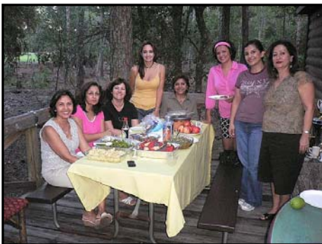
IAS Ladies enjoying an elaborate lunch at Disney Camp Fort Wilderness.