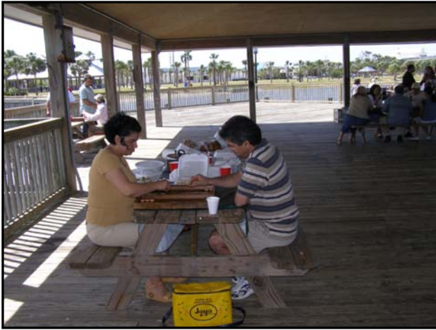
IAS Members are enjoying a friendly game of backgammon.

The celebration of Spring was capped off and enjoyed by an enthusiastic group at the Sizdeh Bedar Picnic at City Island River Park on April 1, 2007. Sizdeh Bedar marks the 13 th day of Spring. Food was a buffet luncheon of traditional dishes and fun activities were planned for all ages including a backgammon tournament.